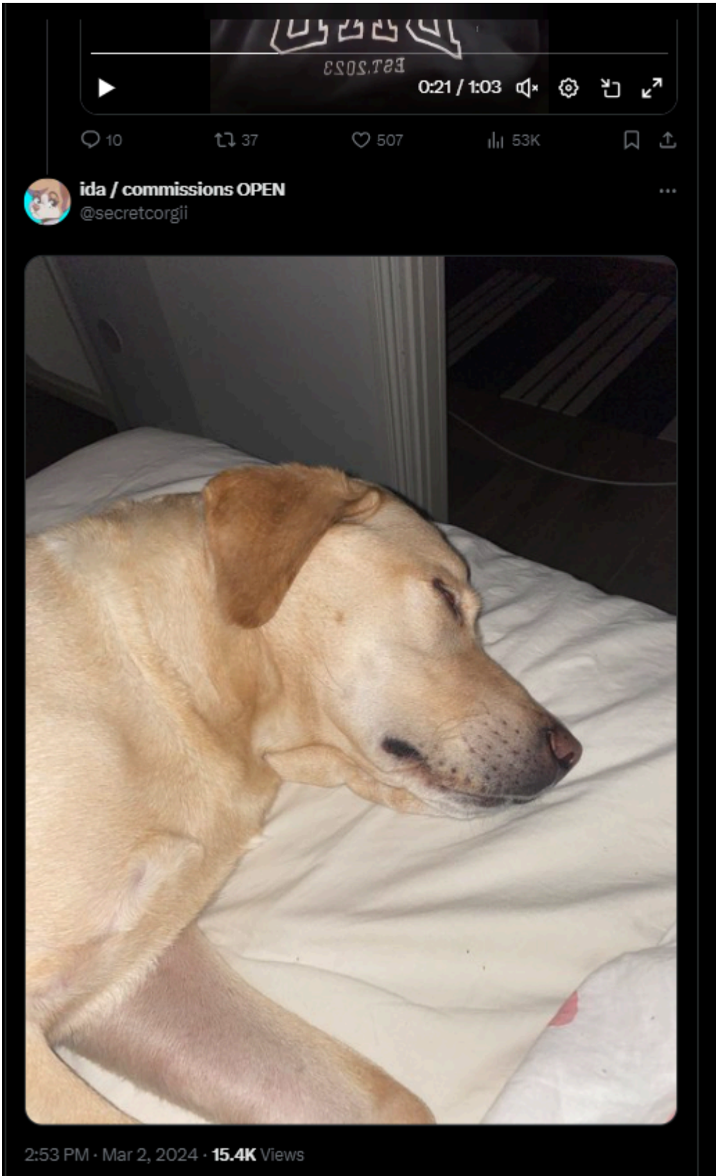
Pyro's reply and Ida's reply