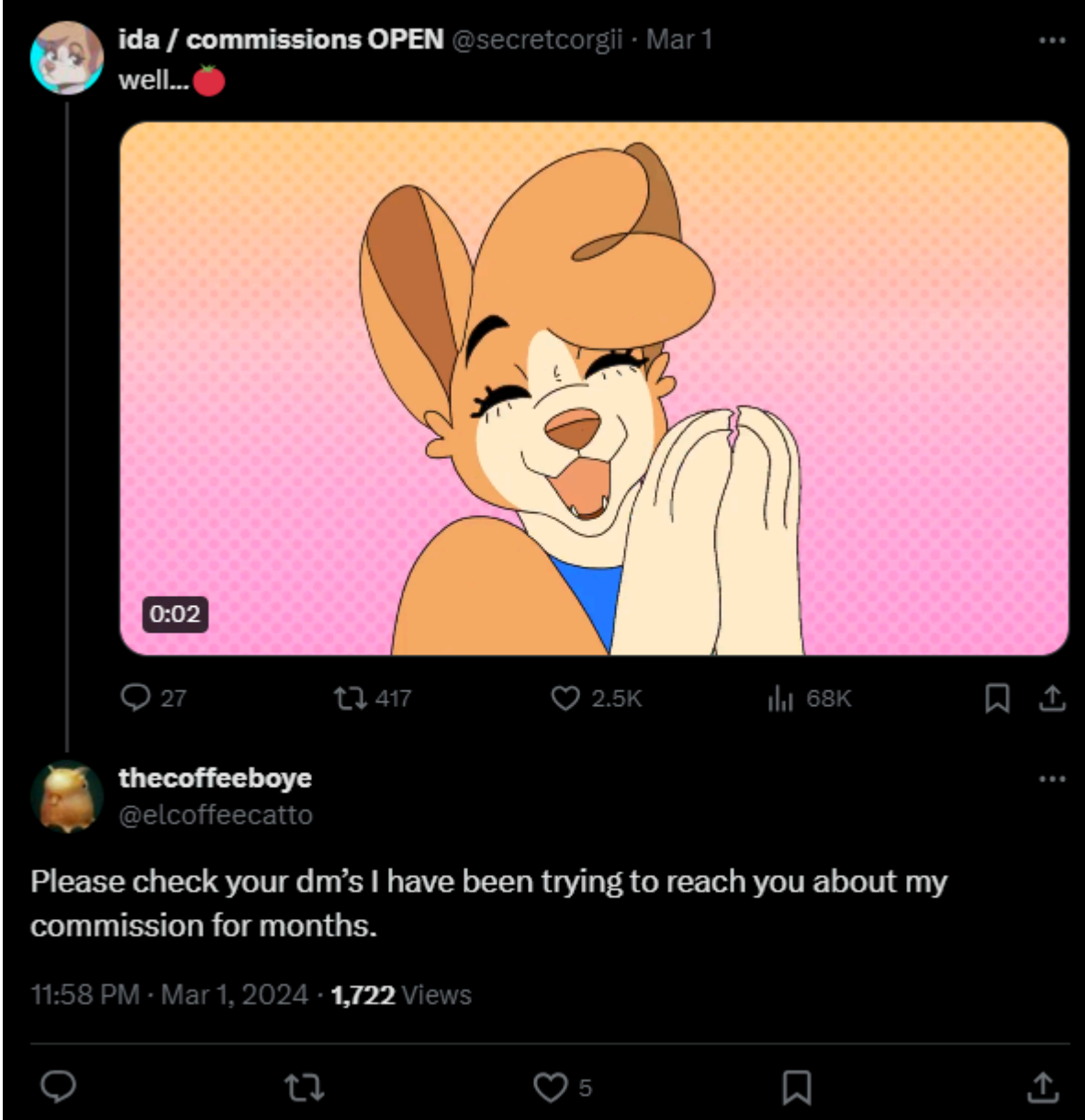
Coffee's other reply