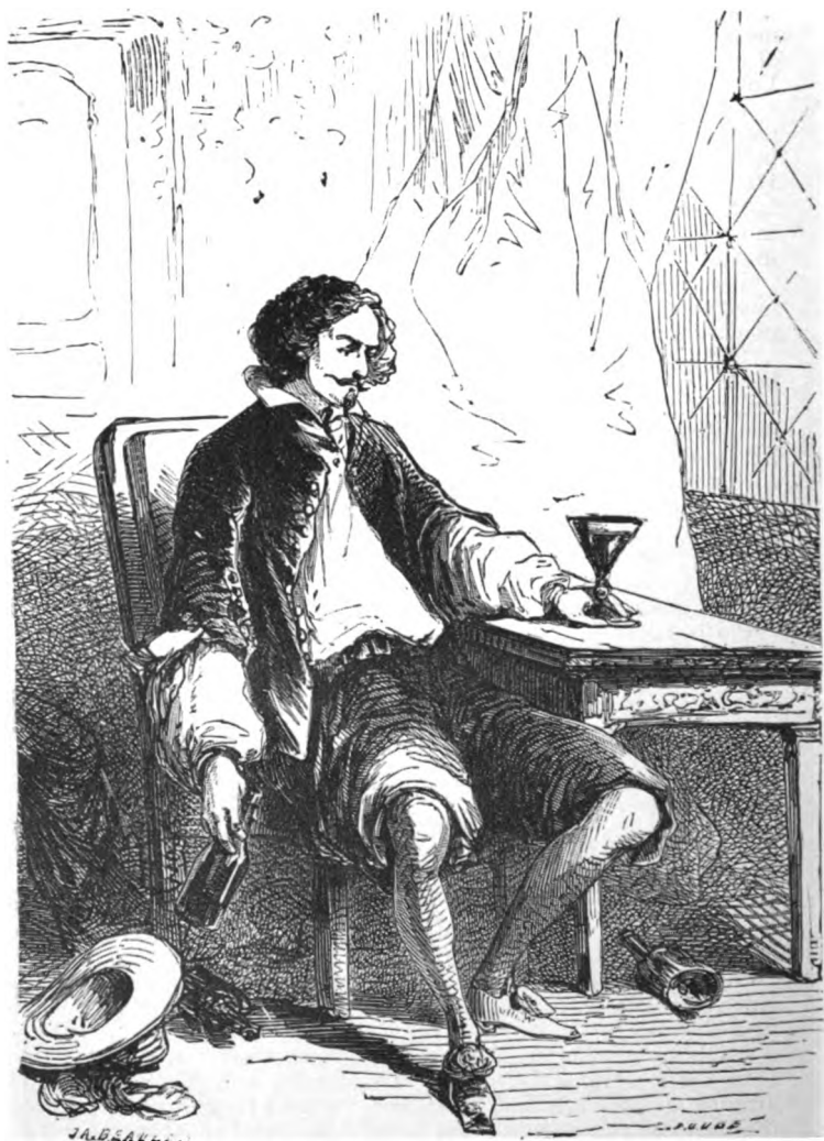
"ATHOS SIPPED THE LAST BOTTLE OF HIS SPANISH WINE."