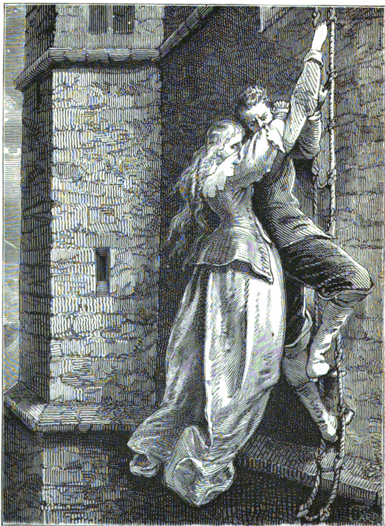
ESCAPE OF MILADY.