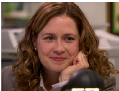
Pam 'The Office'

“I'm going to take a powernap in the storeroom – if I'm not back in five, come slap me with the cold butter.”