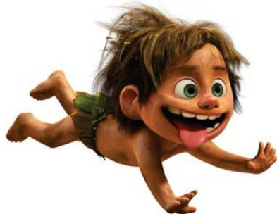
Spot 'Good Dinosaur'