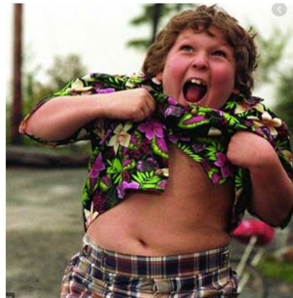
Chunk 'The Goonies'