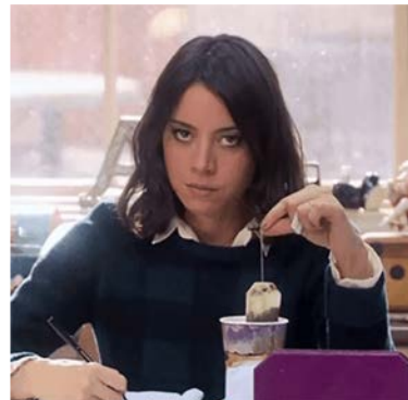
April 'Parks & Rec'