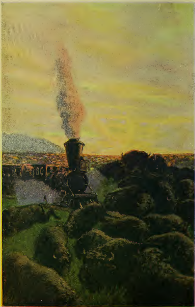
A herd of from ten to twelve thousand head block the railroad.