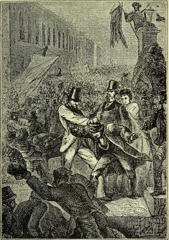
If Fix had not, devotedly, received the blow . . .