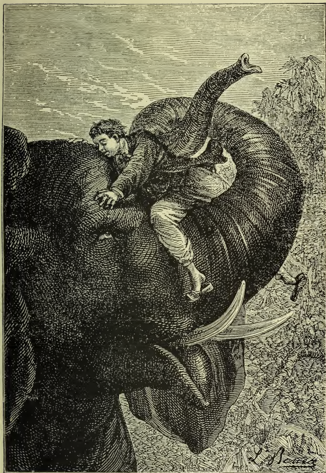
Passepartout, not at all frightened . . . .