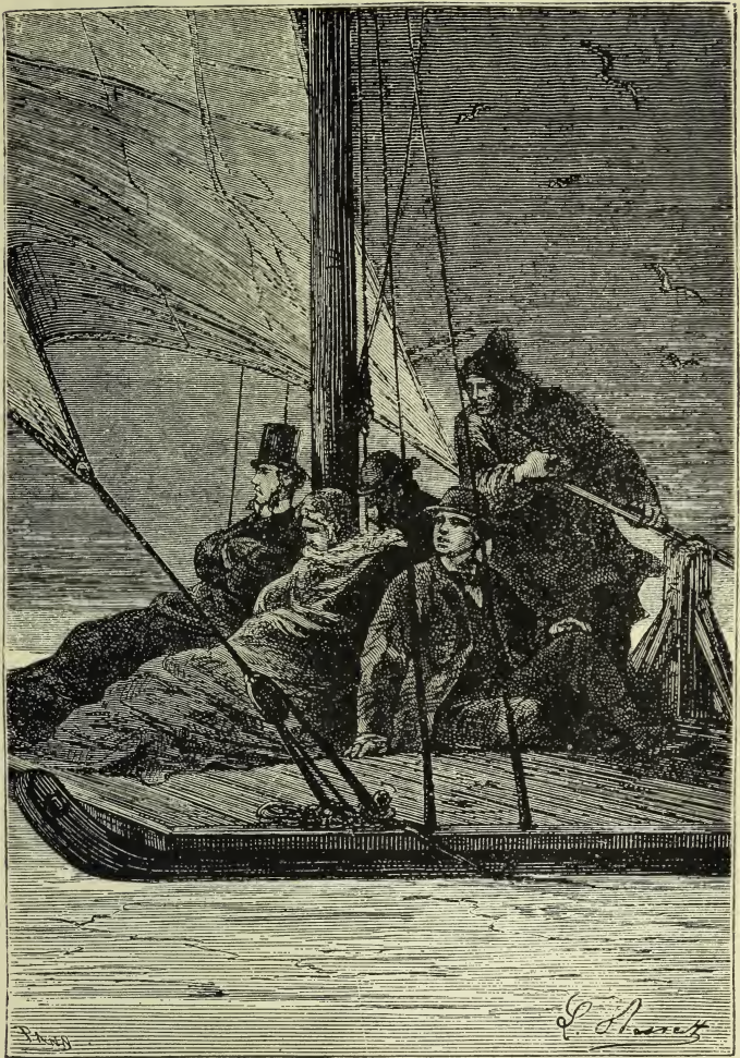
The travellers, pressed against one another . . .